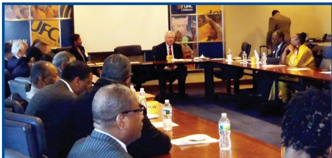
Members of the National Retail Justice Alliance recently invited African American leaders from around the country to meet with Walmart workers and to highlight Walmart's ties with ALEC.

base of opinion leaders, organizations and communities, including the African American, Latino and Asian communities. The alliance will also collaborate with leaders and policy makers affiliated with youth, religious, women's rights and environmental rights organizations.