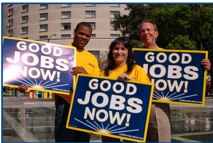
UFCW members across the country are standing up and standing with President Obama for good jobs.