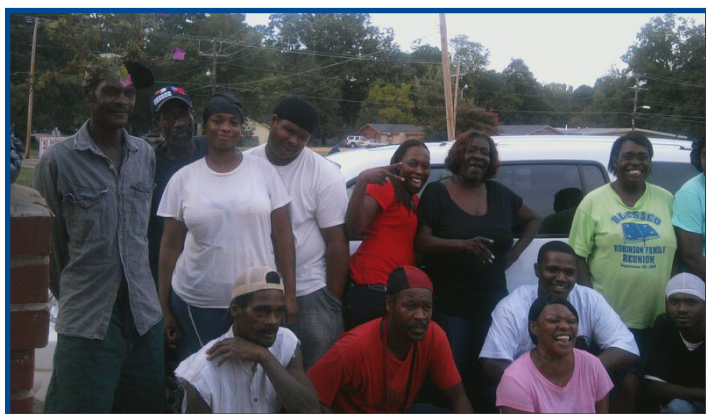
Workers at Water Valley Poultry stood together for a real voice on the job.

On August 19, almost 150 workers at Water Valley Poultry in Water Valley, Miss. voted overwhelmingly for a real voice at work with Local 1529. The workers at the plant kill and process chicken for export and for domestic non-human consumption.