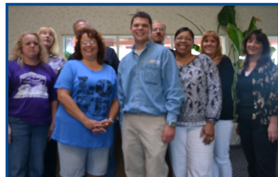
Members of the UFCW in Michigan are standing up for worker rights, are you?

You can join these UFCW Michigan members in the fight to defend workers' rights nationwide, by helping the Active Ballot Club (ABC) lead the charge to elect pro-worker candidates.