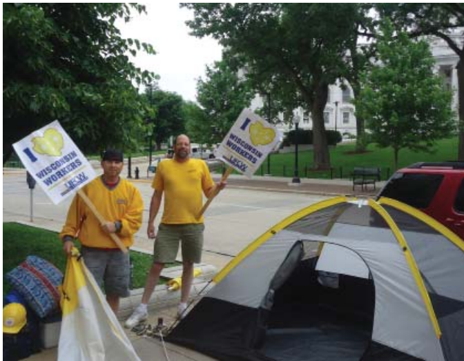
UFCW members camped out at the capitol in Madison in June to protest Governor Walker's radical anti-worker agenda.