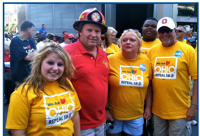
UFCW Local 75 members stand with a firefighter supporter as they march to turn in over a million signatures for the repeal of SB5 in Ohio.

On June 29, members of Local 75 along with We Are Ohio and thousands more community members marched down the streets of Columbus, Ohio to deliver signatures that will put Senate Bill (SB) 5, a bill that directly attacks working families, on the November ballot for repeal.