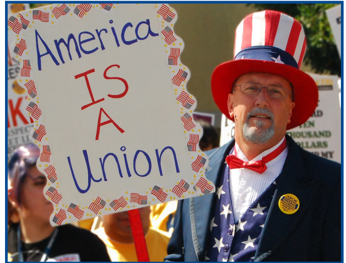
Uncle Sam stands with grocery workers outside Vons corporate headquarters in Arcadia, Calif.

UFCW grocery members in Southern California have been without a contract since March 2011 while bargaining continues with the three largest grocery chains: Vons (a unit of Safeway), Albertsons (a unit of Supervalu) and Ralphs (a unit of Kroger). OP