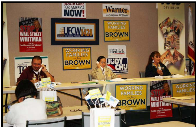
Local 1428's member-driven phone banks are part of the reason Jerry Brown and Barbara Boxer are moving ahead in the pre-election polls.

Races in California are at a fever pitch and many local unions have turned out members to reach voters. Jerry Brown and Barbara Boxer are recording strong leads over millionaires Meg Whitman and Carly Fiorina and UFCW members deserve credit for a strong effort in that race.