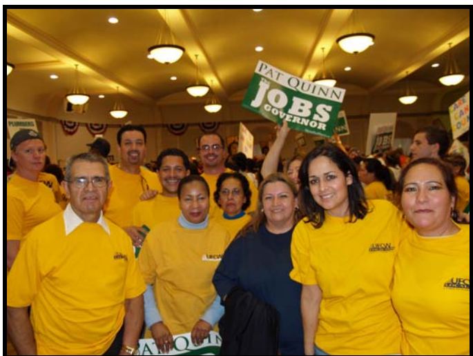
Local 1546 members are turning out the vote for Illinois Governor Pat Quinn.