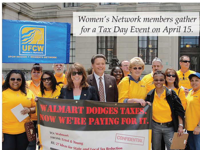
Women's Network members gather for a Tax Day Event on April 15.

The year 2011 looks promising and hopeful, and with your support the Women's Network will continue to be a positive resource within the UFCW as we strive to continue to provide a better quality of life for working families. WN